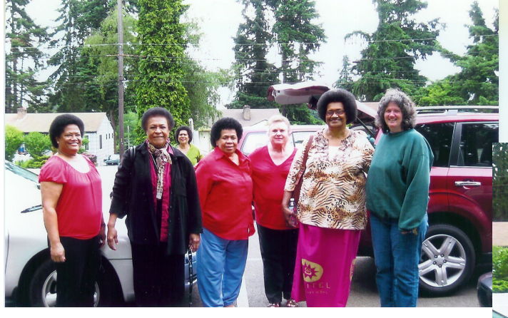
Anxious to go

Sidonia's flowers added a warm touch to the event