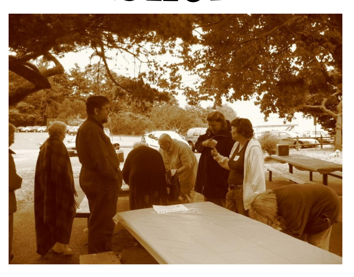
Many wore jackets to stay warm while getting things set-up

By the end of the Picnic we decided that it was very enjoyable. It seemed that we had known each other for a very long time. We vowed to do it again and to get together often.