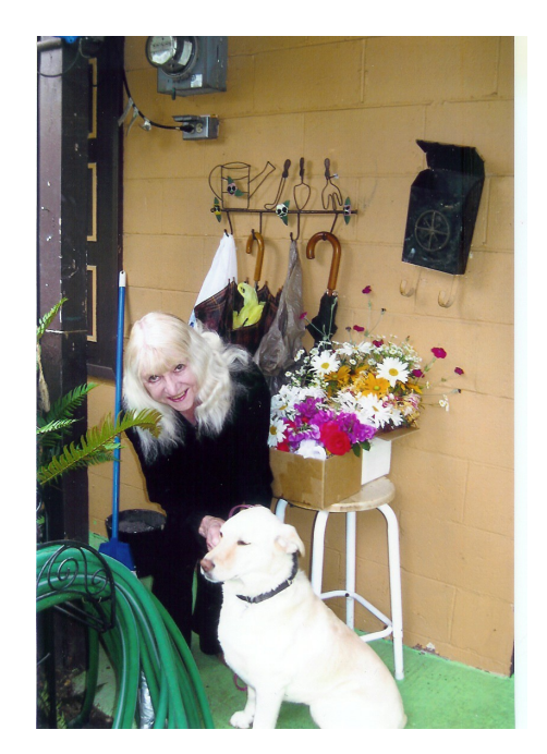
Sindonia always sends flowers for the tables