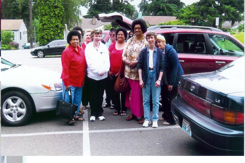
Okay, One Last Picture