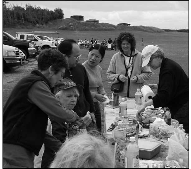
A yummy picnic lunch at Ebey's Landing