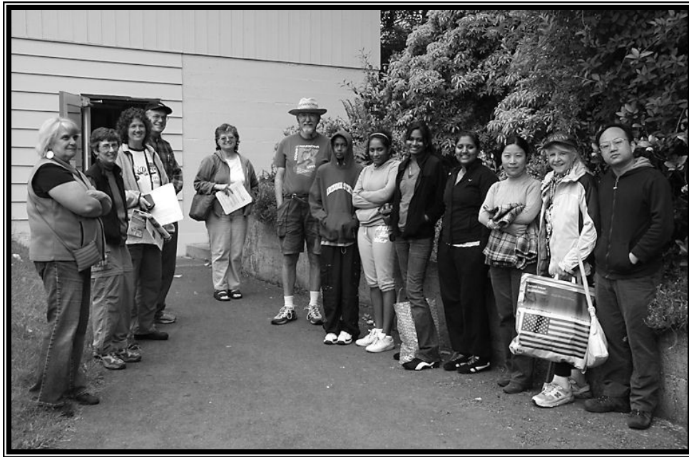
Here are some of the participants gathering at our church for the Whidbey Island adventure.

Sixteen persons participated in the all-day "field trip" to Whidbey Island. We enjoyed various striking views from Deception Pass bridge, even watched an eagle in its perching tree near the bridge, then made our way to Ebey's Landing, where we shared our brownbag picnic lunches. Most of us decided to make the vigorous hike up to and along the bluff overlooking the Strait of Juan de Fuca. We saw farmland and woodland north of the trail, and the sensational views south across the strait toward Port Angeles. Lots of fun, and lots of photos!