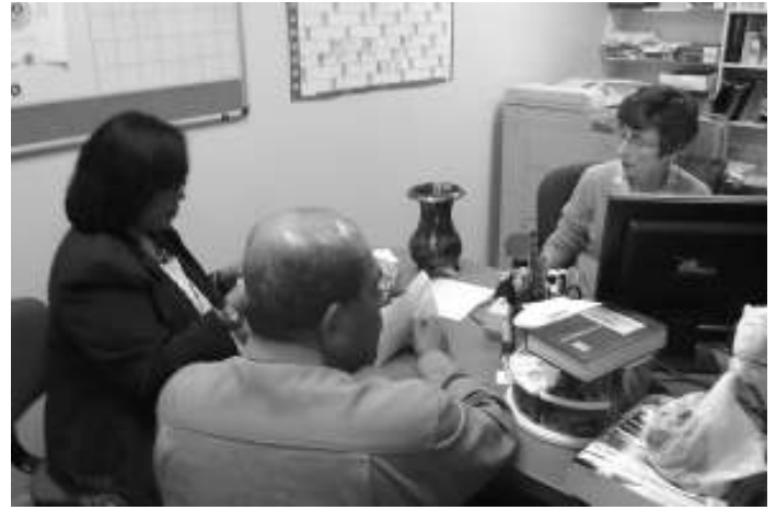
Our team of counters, busy after church!