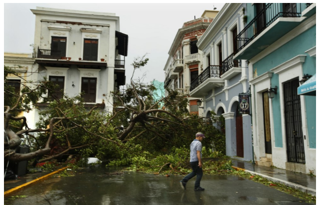
The town of El Viejo San Juan after Hurricane Maria hit the island. Please continue to pray for Puerto Rico's rebuilding.