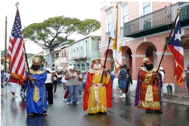
People celebrating Three Kings Day in the beautiful town of El Viejo San Juan (Old San Juan) circa 2016

Christmas season and cultural traditions are so special. If you would like to share one of your traditions in an upcoming newsletter, please let the church office know! Thank you for reading!