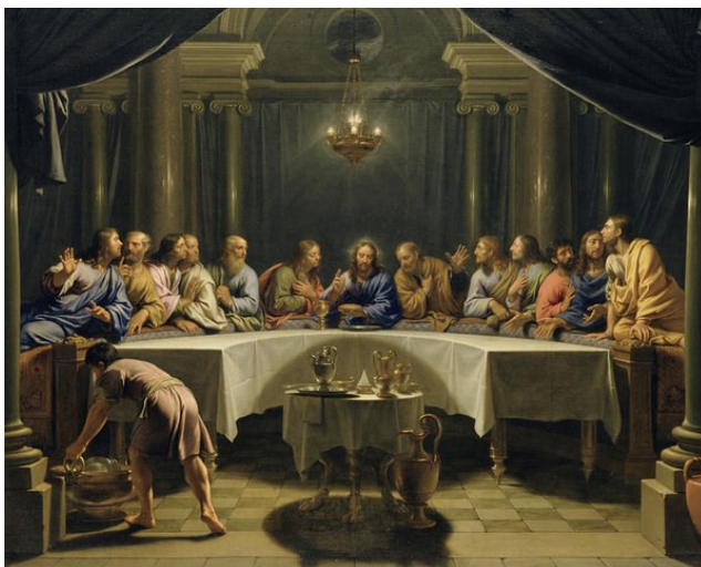
“The Last Supper” by Jean Baptiste de Champaigne circa 1678

The evening of Holy Thursday would ultimately set in motion the phenomenal events that would save us all. Jesus knew his fate and what would come in just 3 short days. He knew that Judas would betray him. He knew that Peter would deny him. He knew the agony that awaited. Knowing all that was to come, Holy Thursday serves as one of the best humanly accessible examples of love Jesus showed us. Not only did he give us a new commandment: “Love one another as I have loved you” but he showed us exactly how. He gave of himself. By humbly washing all of his disciples’ feet, a task that was generally done by a person for themselves or by a slave, he showed us true service to others. He not only provided a meal but he gave of himself by breaking bread and offering it as his body. Our dear Lord then offered his blood so that we may be forgiven, for soon, his literal blood would be poured out for us. Through His humility and servanthood, Jesus exemplified for us what true love looks like.