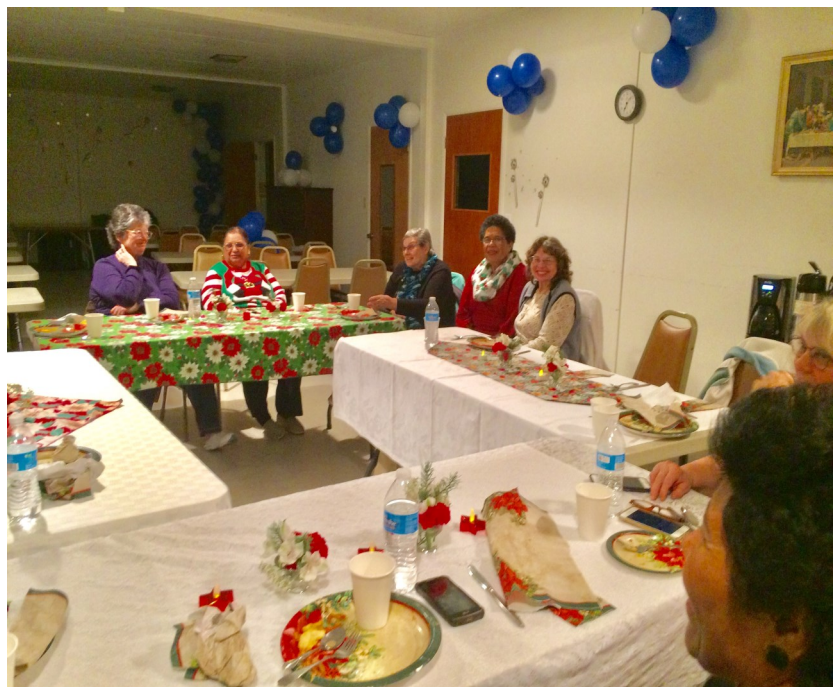
Welcoming new friends to our Holiday party.