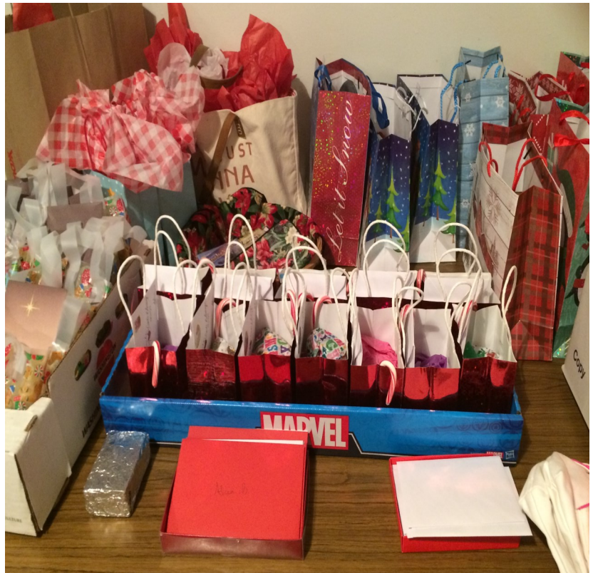
Sharing our gifts for all.