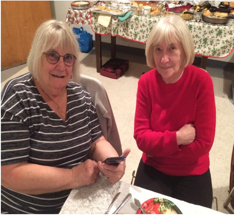
Food and sharing a plenty.